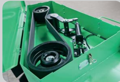
...► The TBU 3P is equipped with a low-maintenance belt drive.