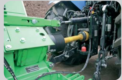
...► Connection by stable PowerDrive PTO shaft with overload clutch