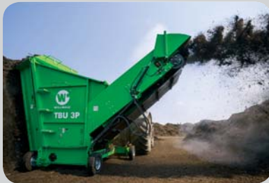
...► TBU in action: Restacking of trapezoidal heaps up to 3 meters with 0,5 km/h more

Changes to technical data is reserved. Coping and reprint only allowed with our permission.